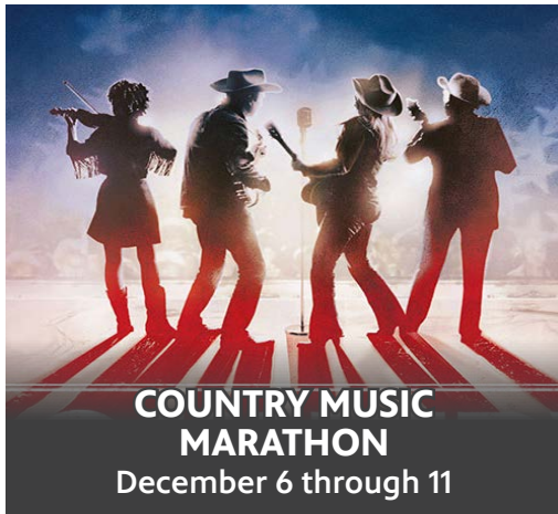
COUNTRY MUSIC MARATHON December 6 through 11