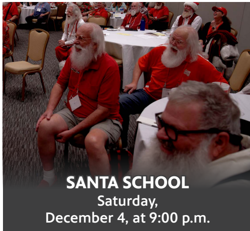
SANTA SCHOOL Saturday, December 4, at 9:00 p.m.