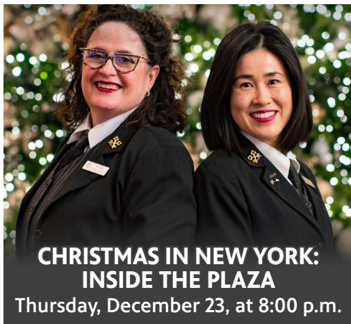
CHRISTMAS IN NEW YORK: INSIDE THE PLAZA Thursday, December 23, at 8:00 p.m.