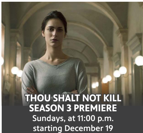
THOU SHALT NOT KILL SEASON 3 PREMIERE Sundays, at 11:00 p.m. starting December 19