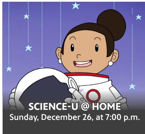
SCIENCE-U @ HOME Sunday, December 26, at 7:00 p.m.