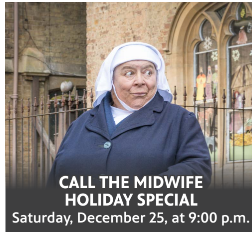
CALL THE MIDWIFE HOLIDAY SPECIAL Saturday, December 25, at 9:00 p.m.