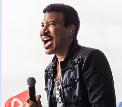
Lionel Richie at Glastonbury Sunday, March 8, at 8:00 p.m.