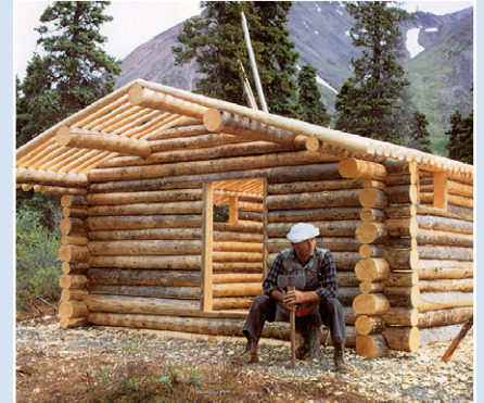
Alone in the Wilderness Monday, March 9, at 8:00 p.m.

Make your donation to WPSU by calling 1-800-245-9779, or go online to wpsu.org .