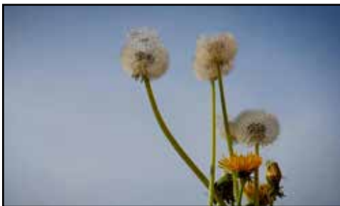
The WPSU digital series "Year-Round Gardening" gives basic gardening tips throughout the year and features instructional clips from Penn State Extension Educators and Master Gardeners.