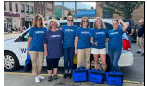
WPSU staff and volunteers traversed our service area to take part in multiple community parades throughout central and northern Pennsylvania.