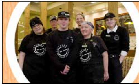
A new WPSU original series, "Culinary Connections" tells the stories of people and places in our area that use food to connect with the world around them.