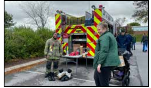
WPSU invited community and Penn State groups to participate in Eventapalooza, a family and community focused event held at WPSU Studios in October 2023.