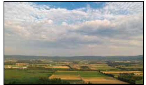
"Our Town: Big Valley" premiered on WPSU-TV in September 2023, featuring stories about the people, places, and history of the region.