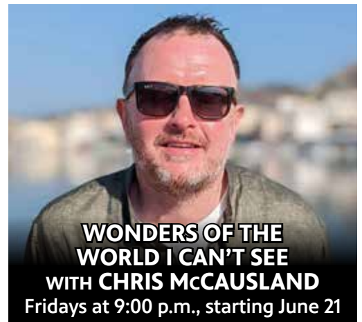
WONDERS OF THE WORLD I CAN'T SEE WITH CHRIS MCCAUSLAND Fridays at 9:00 p.m., starting June 21