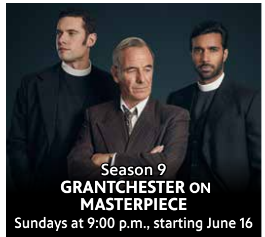
Season 9 GRANTCHESTER ON MASTERPIECE Sundays at 9:00 p.m., starting June 16