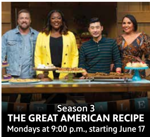
Season 3 THE GREAT AMERICAN RECIPE Mondays at 9:00 p.m., starting June 17