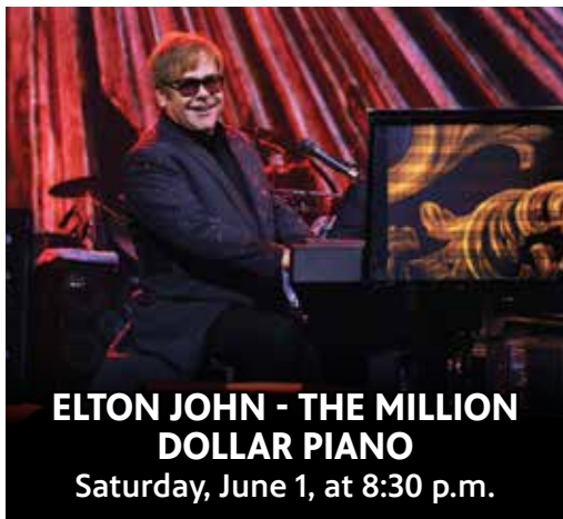
ELTON JOHN - THE MILLION DOLLAR PIANO Saturday, June 1, at 8:30 p.m.

Saturdays at 8:00 p.m., starting June 29