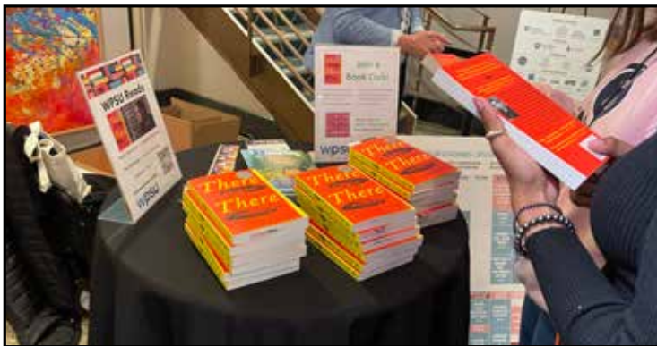
WPSU’s event table pictured at a local library featuring “There, There” by Tommy Orange for discussion