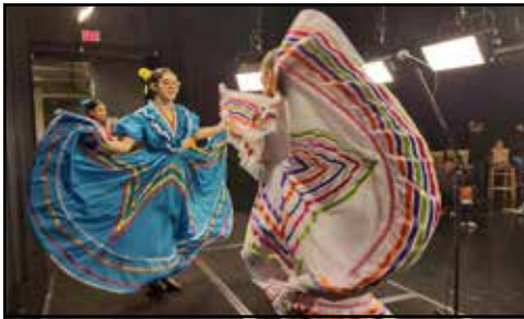
WPSU invited families, community, and Penn State groups to participate in the Multicultural Children's Festival held at WPSU Studios in April 2023, to showcase the diversity of those who live within central Pennsylvania.