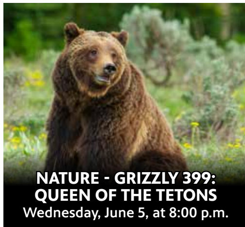
NATURE - GRIZZLY 399: QUEEN OF THE TETONS Wednesday, June 5, at 8:00 p.m.