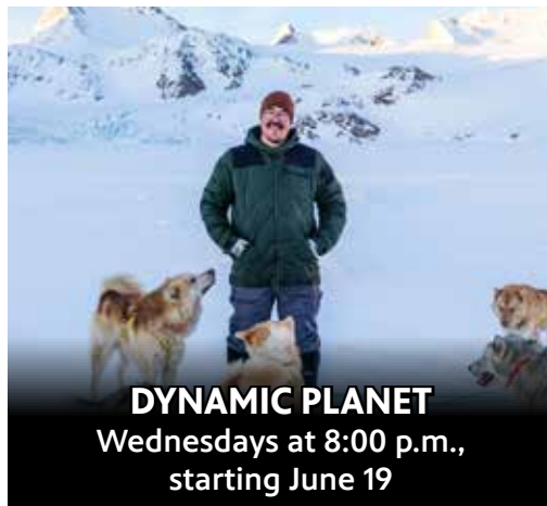
DYNAMIC PLANET Wednesdays at 8:00 p.m., starting June 19