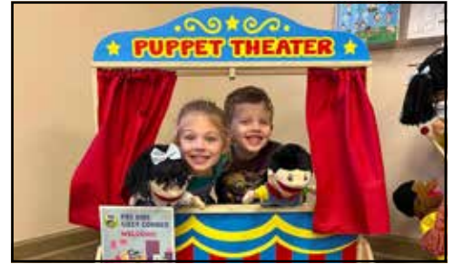
In 2023, WPSU raised funds to expand the resources and activities offered at our PBS KIDS Cozy Corners in locations across northern and central Pennsylvania.