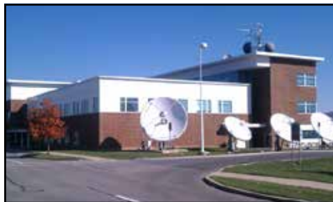
WPSU continues to update the Virtual Field Trips website, which explores Fort Roberdeau in Altoona, Shaver's Creek Environmental Center in Petersburg, the Centre County Recycling and Refuse Authority in State College, Elk Country, and WPSU production facilities.